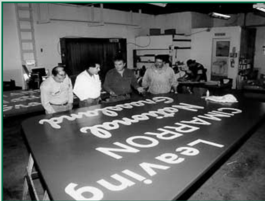
Juniper, an underutilized species, is being mixed with plastic to produce exterior signs at P&M Signs in Mountainair, New Mexico.

splitting and cracking and that steel posts are more durable and easier to install than roundwood. For wood to be competitive with steel, there has to be a cost advantage (18). In addition, roundwood for guardrails and signposts needs acceptance by highway engineers. If accepted, this could open a significant market for SDU material.